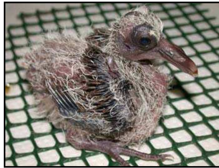
the same HR Mauritius Pink pigeon chick at the age of 5, 15, 27 and 32 days (Mulhouse Zoo)